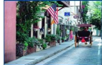
Historic St. George St