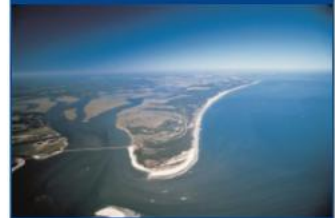
Aerial view of Amelia Island