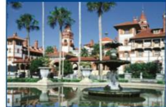
St. Augustine, our Nation's Oldest City