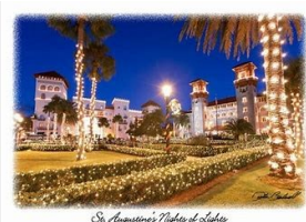
St. Augustine's Nights of Lights

Travel Expressions of Florida LLC 806 26th Avenue Vero Beach, Florida 32960